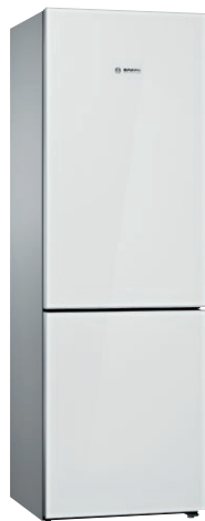
B10CB81NVW White Glass