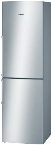
B11CB50SSS Stainless Steel

The specifically engineered hidden hinge and reversible doors allow for a next-to-wall placement and nearly flush installation.