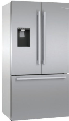
B36CD50SNS Stainless Steel