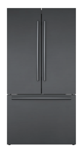
B36CT80SNB Black Stainless

Also available in: Stainless Steel B36CT80SNS