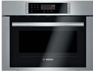
HMC54151UC Stainless Steel

The 24" speed oven pairs the cooking qualities of a conventional oven with the speed of a microwave, designed for smaller spaces.