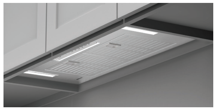
Installed in framed cabinets