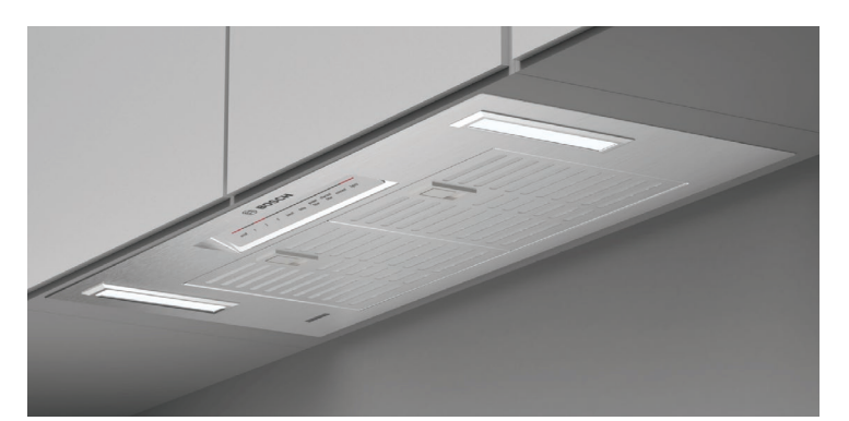
Installed in frameless cabinets

Accessories: To purchase Bosch accessories, cleaners & parts please visit www.bosch-home.com/us/store or call 1-800-944-2904 (Mon to Fri 5 am to 6 pm PST). Sat 6 am to 3 pm PST). Notes: All height, width and depth dimensions are shown in inches. BSH reserves the absolute and unrestricted right to change product materials and specifications, at any time, without notice. Consult the product's installation instructions for final dimensional data and other details prior to making cutout.