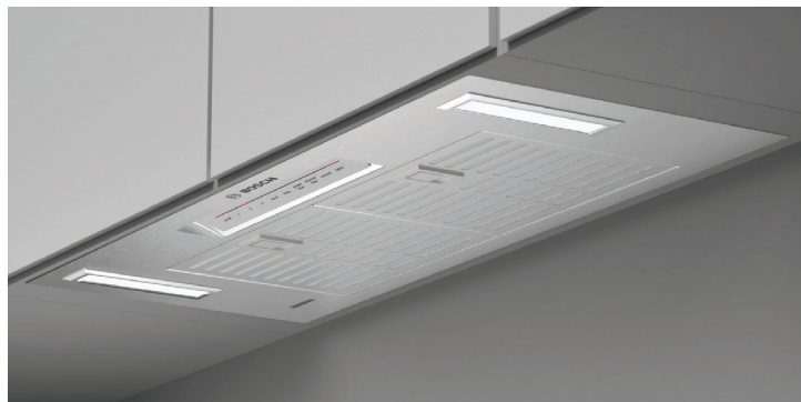
Installed in frameless cabinets

Accessories: To purchase Bosch accessories, cleaners & parts please visit www.bosch-home.com/us/store or call 1-800-944-2904 (Mon to Fri 5 am to 6 pm PST, Sat 6 am to 3 pm PST).