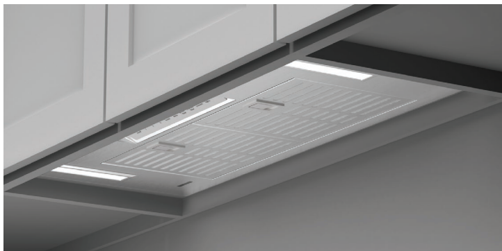
Installed in framed cabinets