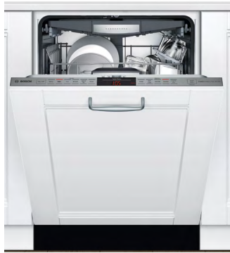
SHVM78Z53N Custom Panel

Patented CrystalDry™ technology transforms moisture into heat to get dishes, including plastics, 60% drier. 1