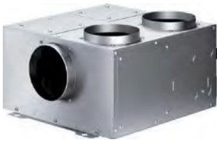
AR 400 742 Metal housing 600 CFM Inside installation Air extraction